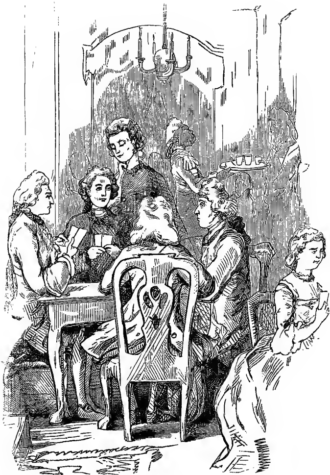
The Ruling Passion.